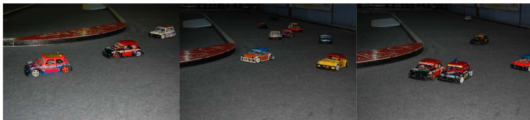
Action for the Ministox Grand Final