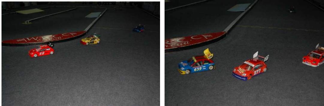
Action from the Hot Rod Grand Final

past Phillip on lap 54 to move into 2 nd . Jaik Golloghly was fighting back after a poor start and also passed Phillip on lap 66 to take 3 rd place ahead of Phillip Potter 4 th and Mark Goodchild in 5 th .