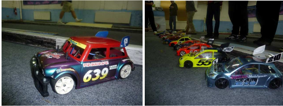
Phillip Potter's Ministox (left) Hot Rod concours (right)

The format for the day was 3 rounds of qualifying (best 2 scores from 3 counting) followed by Semi Finals for those that qualified. Then the top 4 drivers from each Semi Final would race in the Grand Final for each class.