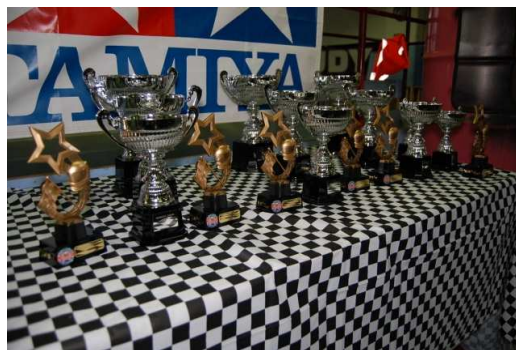
Mardave European Championship Trophies 2011

All in all the meeting was definitely a success and we would like to thank all the drivers for attending and supporting the club and Mardave. For more information and the full results visit www.wycomberacing.co.uk .