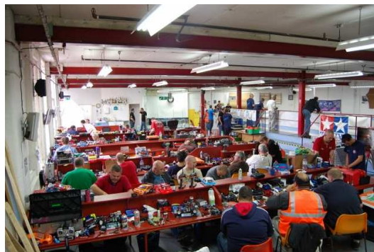
Busy Wycombe Permanent Pit Facilities